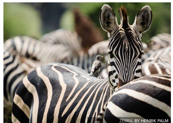
ZEBRA BY HENRIK PALM

After breakfast, check out and drive farther north to Samburu Game Reserve (~4-5 hrs.), within the land of the colorful Samburu people, close relatives of the Maasai, and harbors a number of wildlife species found only north of the equator. It offers unique vistas of rounded and rugged hills and undulating plains. The mix of wood and grassland with riverine forest and swamp is home to a wide