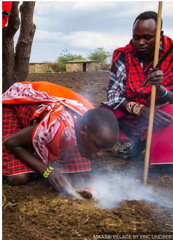
MAASAI VILLAGE BY ERIC LINDBERG

After breakfast, check out and drive to the famous Masai Mara Game Reserve, so named to mean the "spotted plains" in the Maa language. This is home to the greatest concentration of large mammals and is widely recognized as Africa's ultimate wildlife reserve. The park is the northern extension to the vast Serengeti-Mara ecosystem, famous for its annual migration of wildebeest. Arrive for lunch at the lodge and later depart for an sunset game drive in this spectacular location of breathtaking sceneries, never-ending plains, and the most abundant variety of wildlife remaining anywhere in the world. The landscape is made up of rolling savannas dotted with patchy shrubs and bush thickets. Overnight at Mara Sopa Lodge. (BLD)